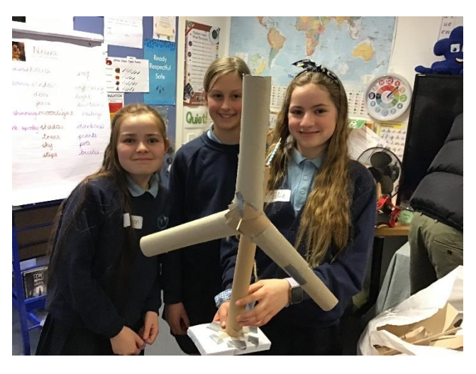
The Year 5/6 children will also be taking part in an exciting Net Zero Superheroes competition