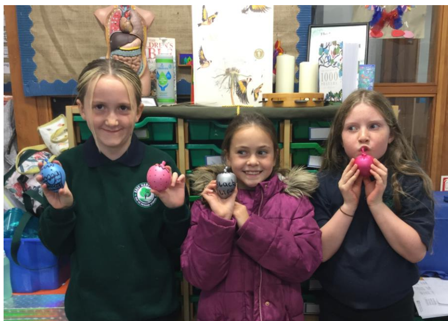
Stress balls – easily made from balloons and flour!